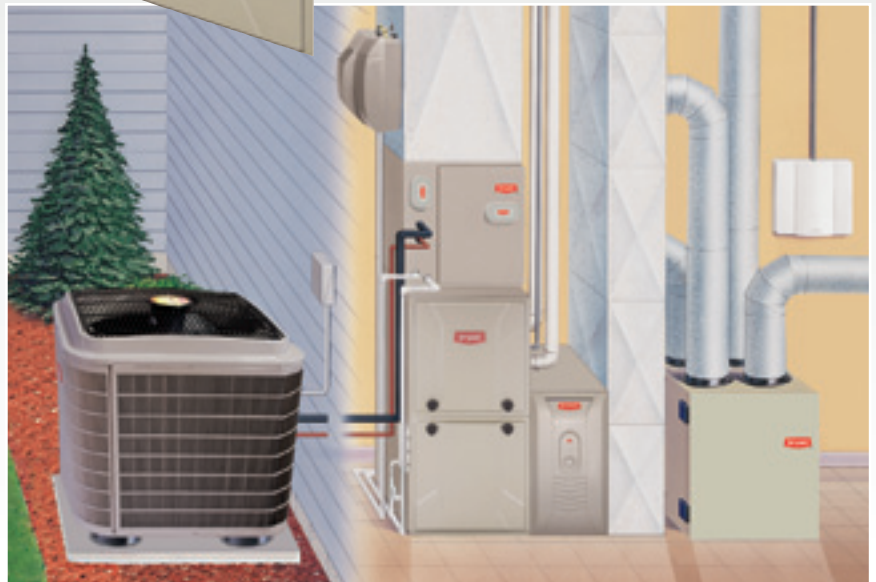
HYBRID HEAT® Deluxe Heat Pump and Deluxe Gas Furnace System

Minnesota Heating and Air Conditioning Incorporated 10701 93rd Avenue North Maple Grove, Minnesota 55369 Office: (763) 424-5235 Service Ext. 301 Sales Ext. 302 Fax: (763) 424-8970 Office Hours: Monday - Friday 8:00 A.M. - 5:00 P.M. Saturday 8:00 A.M. - 12:00 Noon www.mnhtac.com