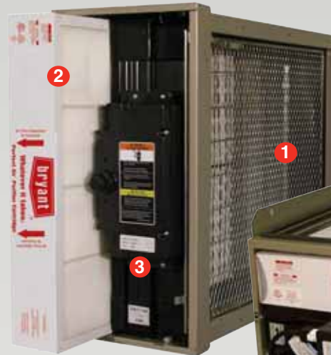
Gas Furnace Model

Exclusive, state-of-the-art technology kills captured viruses, bacteria, mold spores and other allergens.