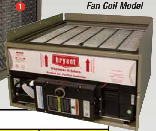
Fan Coil Model