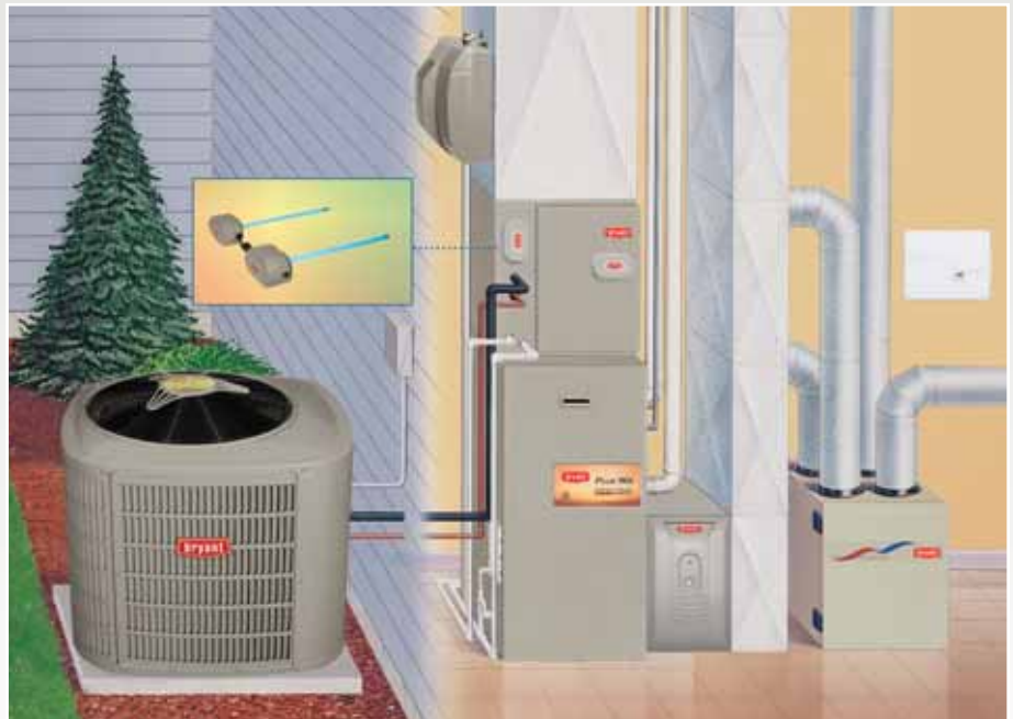
Central Air Conditioner and Gas Furnace System

For accurate, responsive comfort control, Bryant offers several standard and programmable thermostats, each designed to complement your Zone Perfect™ Three-Zone system. Ask your Bryant dealer for details on which thermostats will work in your home.