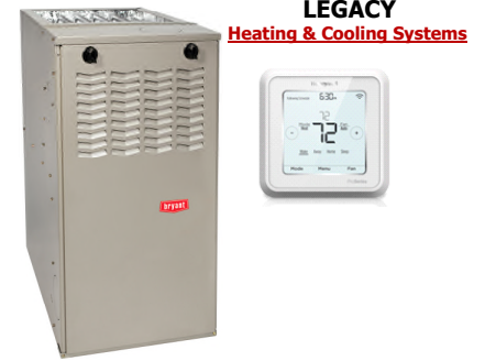
LEGACY Heating & Cooling Systems