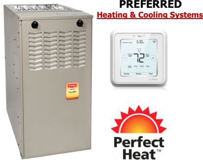
PREFERRED Heating & Cooling Systems