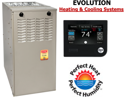
EVOLUTION Heating & Cooling Systems

Since 1989, Minnesota Heating and Air Conditioning has been providing businesses and home owners in Minneapolis, St. Paul and surrounding communities, with the highest level of experience and knowledge in the HVAC industry. Using only Nate certified and licensed technicians, our staff has the capabilities and resources to complete jobs quickly and efficiently. As a full-service company, we offer 24-hour emergency heating and air conditioning service & repairs, preventive maintenance, professional replacement & new installation services.