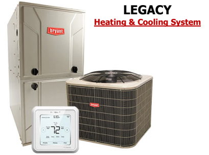
LEGACY Heating & Cooling System