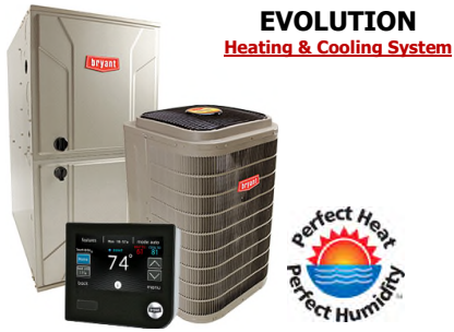
EVOLUTION Heating & Cooling System