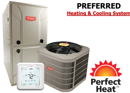
PREFERRED Heating & Cooling System