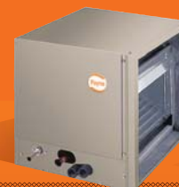
— Cased Horizontal N-Coil CNPHP