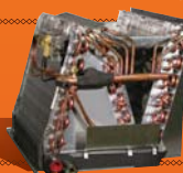
— Uncased Vertical N-Coil CNPVU