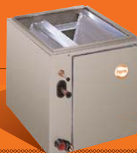
— Cased Vertical N-Coil CNPVP / CNPVT