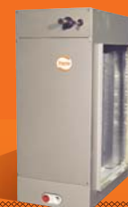
— Cased Slab Coil CSPHP