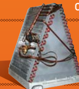
— Uncased Vertical A-Coil CAPVU