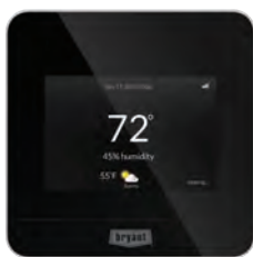
Housewise™ Wi-Fi® Thermostat

Bryant offers a range of solutions for managing your system. Whether you're looking for Wi-Fi® thermostats with energy reporting for the ultimate in connected control, optional zoning management or more basic thermostats—you'll have the system control you want.