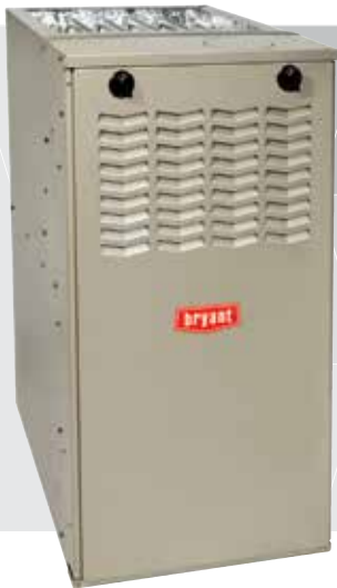
Models 880T and 881T